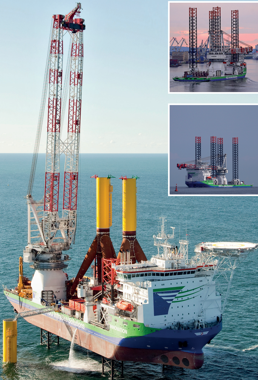
Heavy Lift Jack-Up Vessel Innovation German North Sea